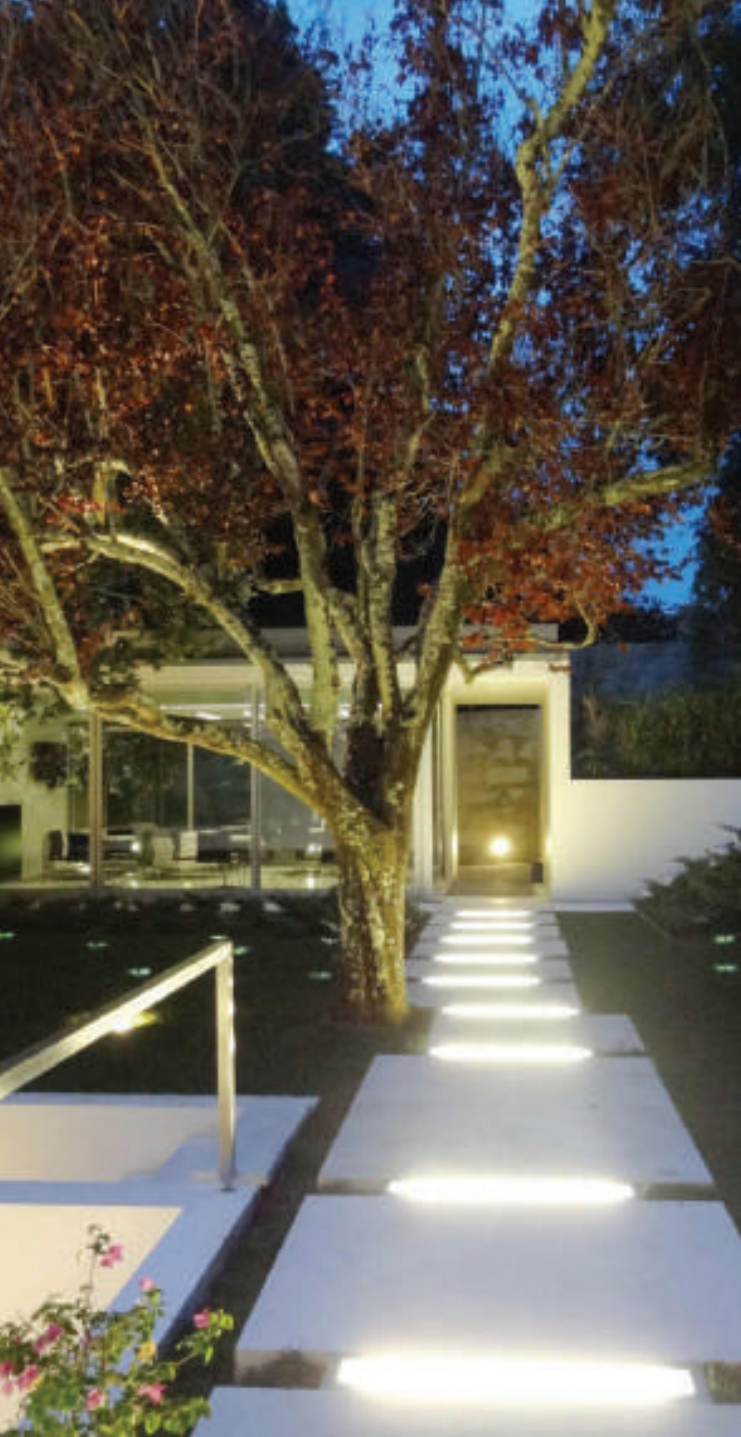
SPI HEADQUARTERS: NATIONAL LANDSCAPE ARCHITECTURE AWARD 2013 (LAURA COSTA)