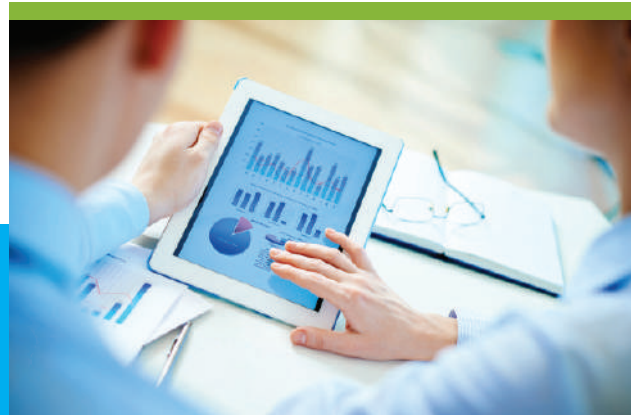
SCIENCE AND TECHNOLOGY

From its beginning the SPI Group has understood the importance of innovation in a dynamic and challenging global society. SPI has developed extensive knowledge in various aspects of the innovation ecosystem and applies this knowledge through a range of activities and services that ultimately foster and accelerate innovation in all its forms. Often we will work with clients to apply an open innovation approach to achieve their particular objectives.